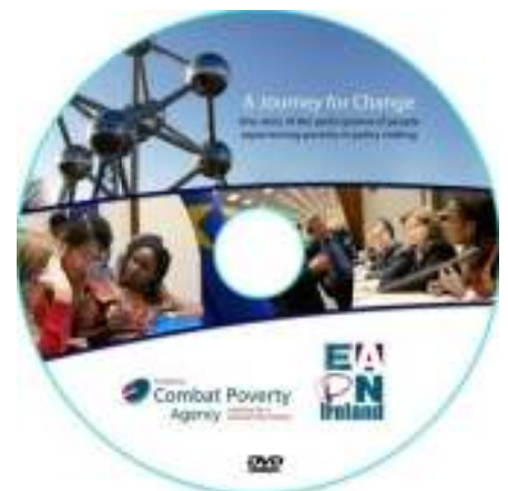
EAPN Ireland DVD, A Journey for Change

In 2008 19 editions of our bi-weekly newsletter, Flash , were circulated to members and those broadly interested in the fight against poverty and social exclusion. The European Flash is produced by EAPN in Brussels, in Ireland the network formats the Flash and adds Ireland specific angles and content. The Flash is used by a variety of stakeholders to disseminate information in Ireland, we regularly receive requests to include information. The Flash is widely identified as a key output of the Network, and EAPN Ireland regularly receives feedback from members and broader stakeholders as to its usefulness.