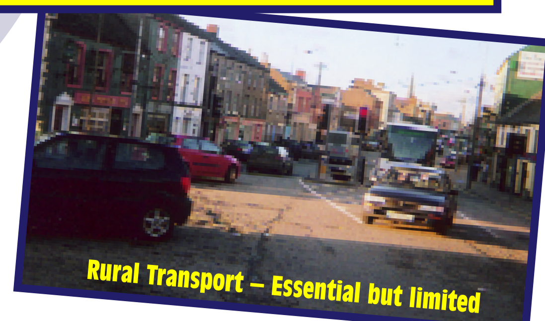
Rural Transport – Essential but limited