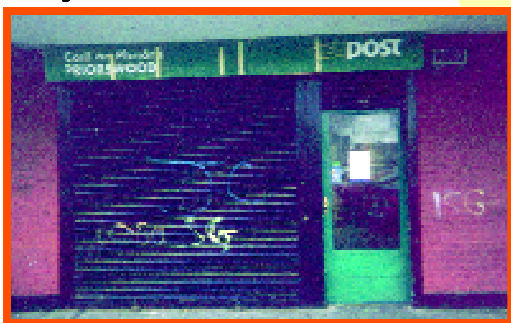
Local post offices closed – long walks to get pensions.