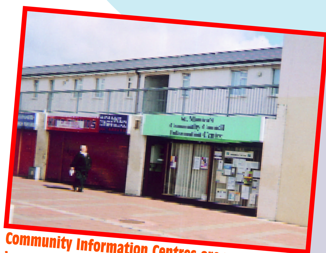
Community Information Centres are very important.