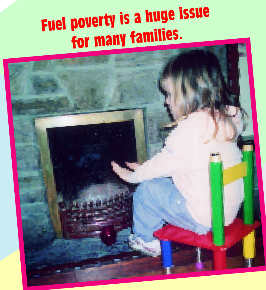
Fuel poverty is a huge issue for many families.