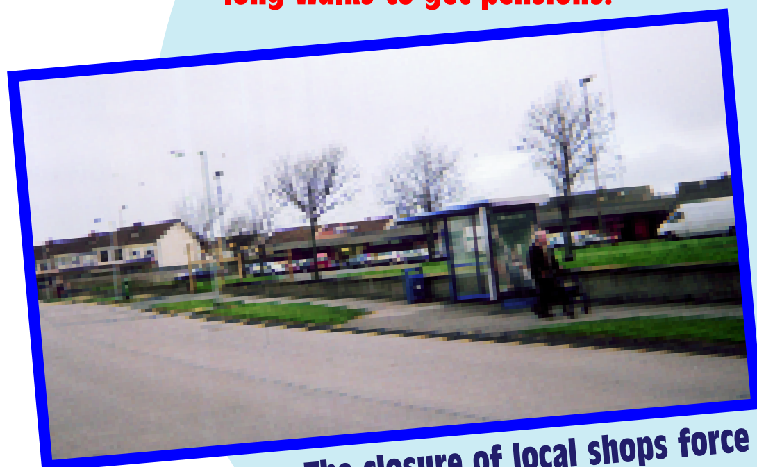
The closure of local shops force old people, and others, to walk to shopping centres.