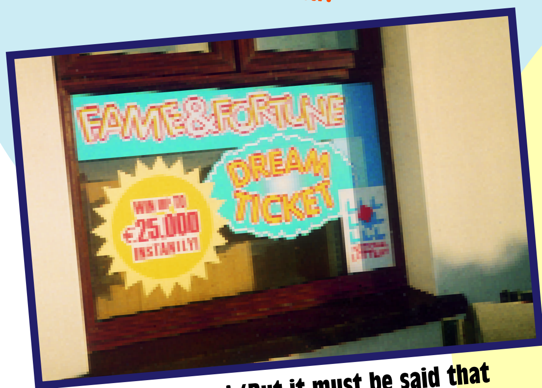
We live in hope! (But it must be said that gambling is a growing problem in Ireland).