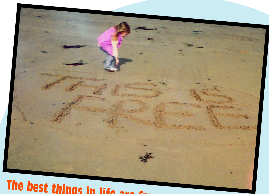
The best things in life are free (but you have to pay to get there!).