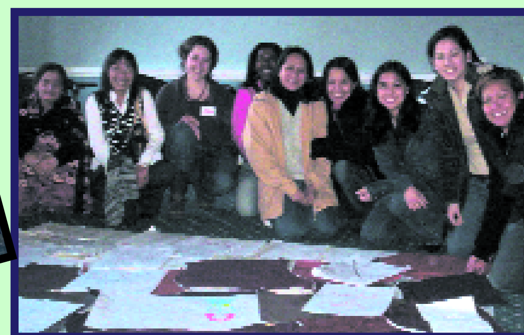
Migrant domestic workers (above) planning the Quilt (below).