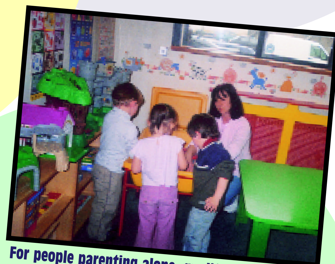
For people parenting alone, quality affordable childcare is needed to allow people to go back to work/education.