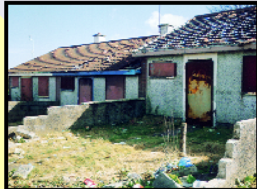
Two views of housing in Ireland.